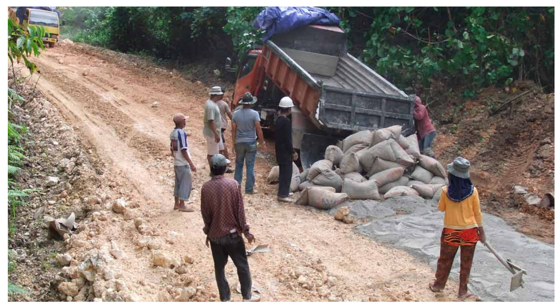
Distribution of cement bags