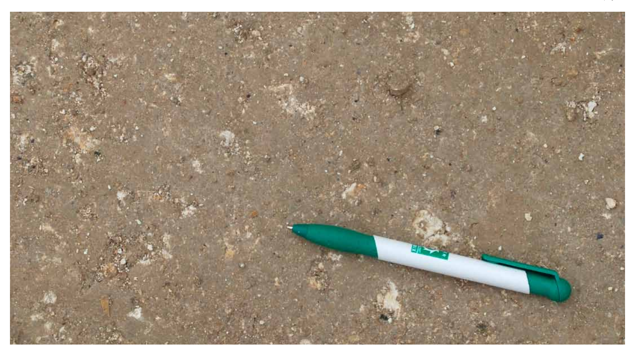
Surface of finished area