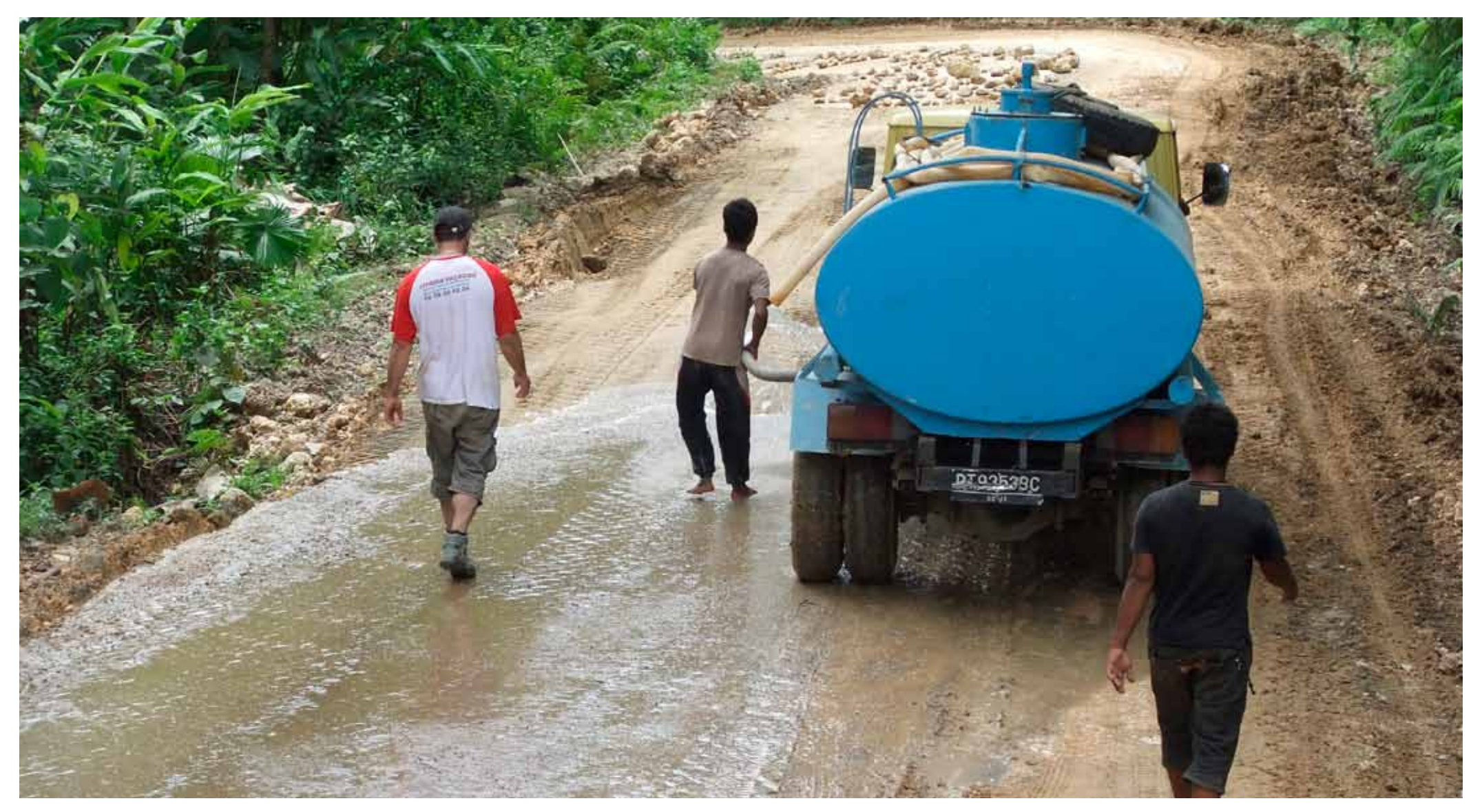
Irrigation of the surface