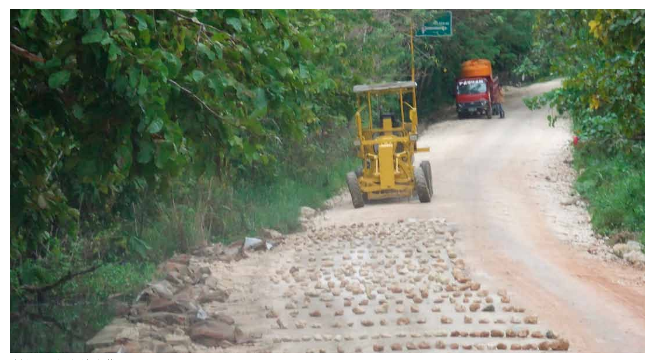
Finished area blocked for traffic