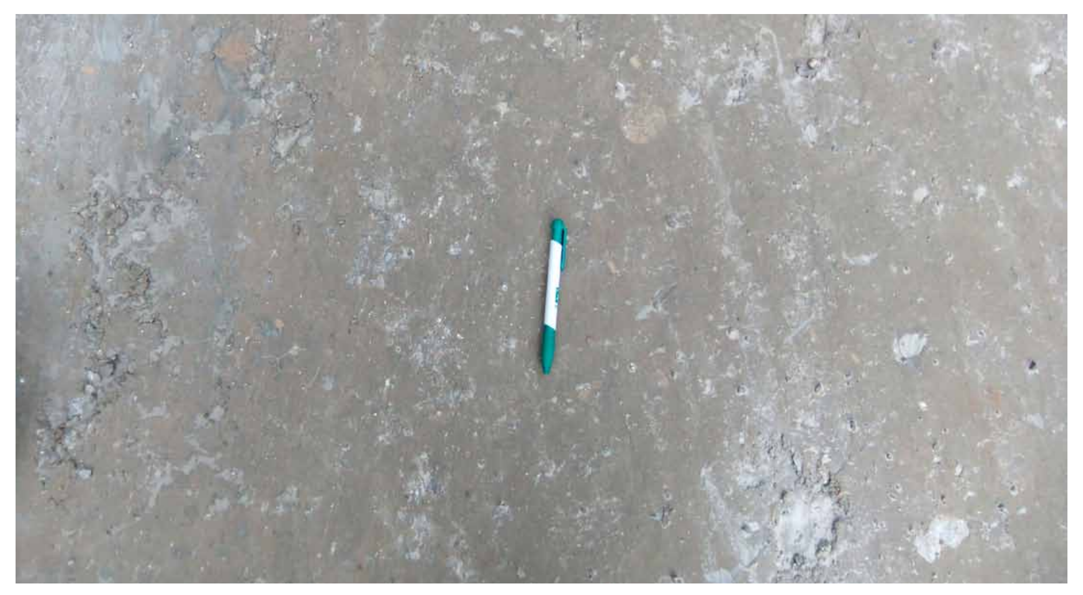
Surface of finished area