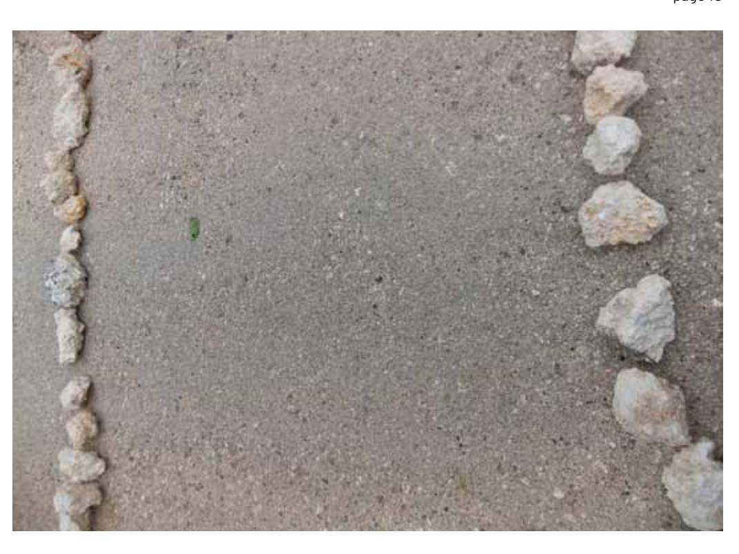
Finished area blocked for traffic