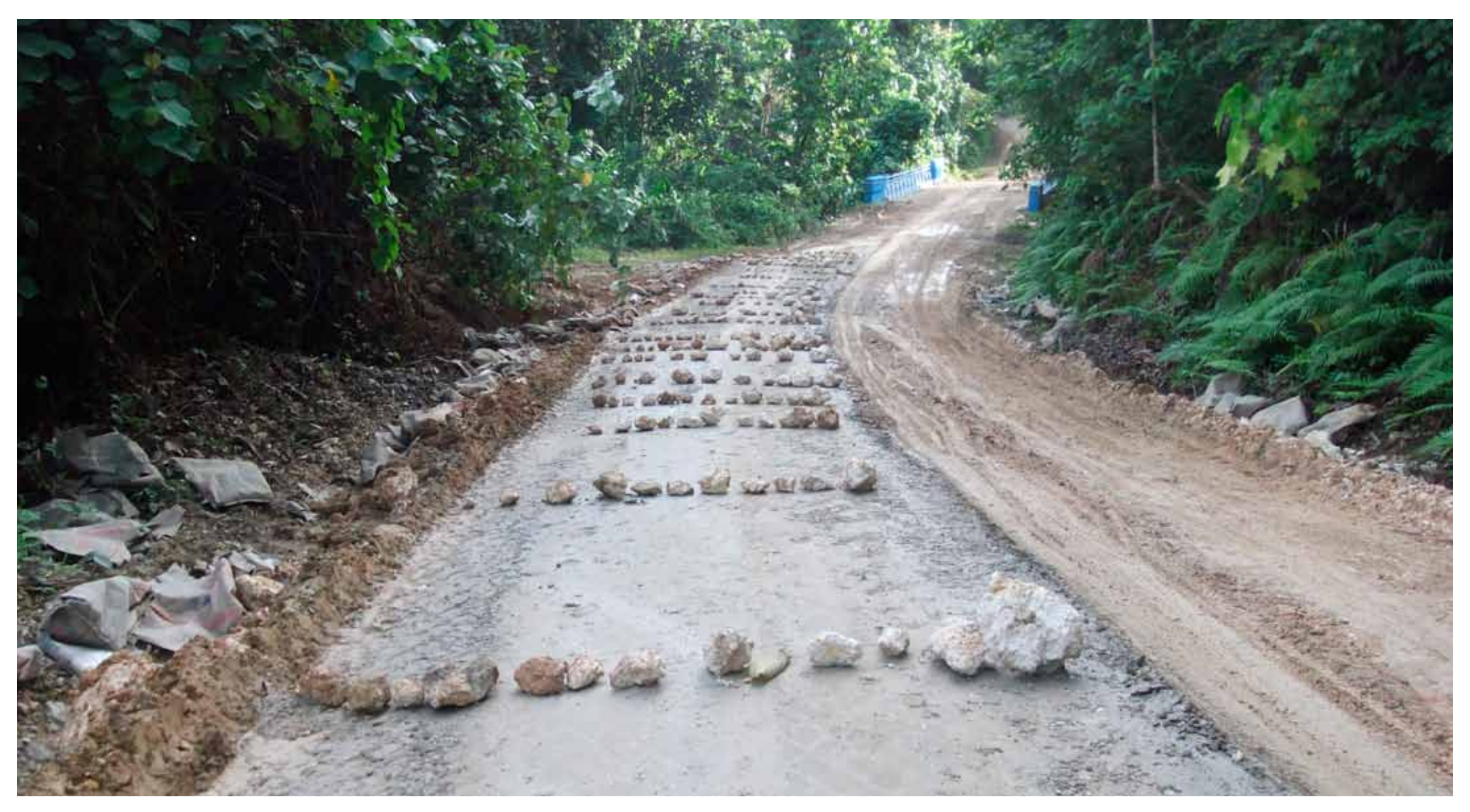
Finished area blocked for traffic