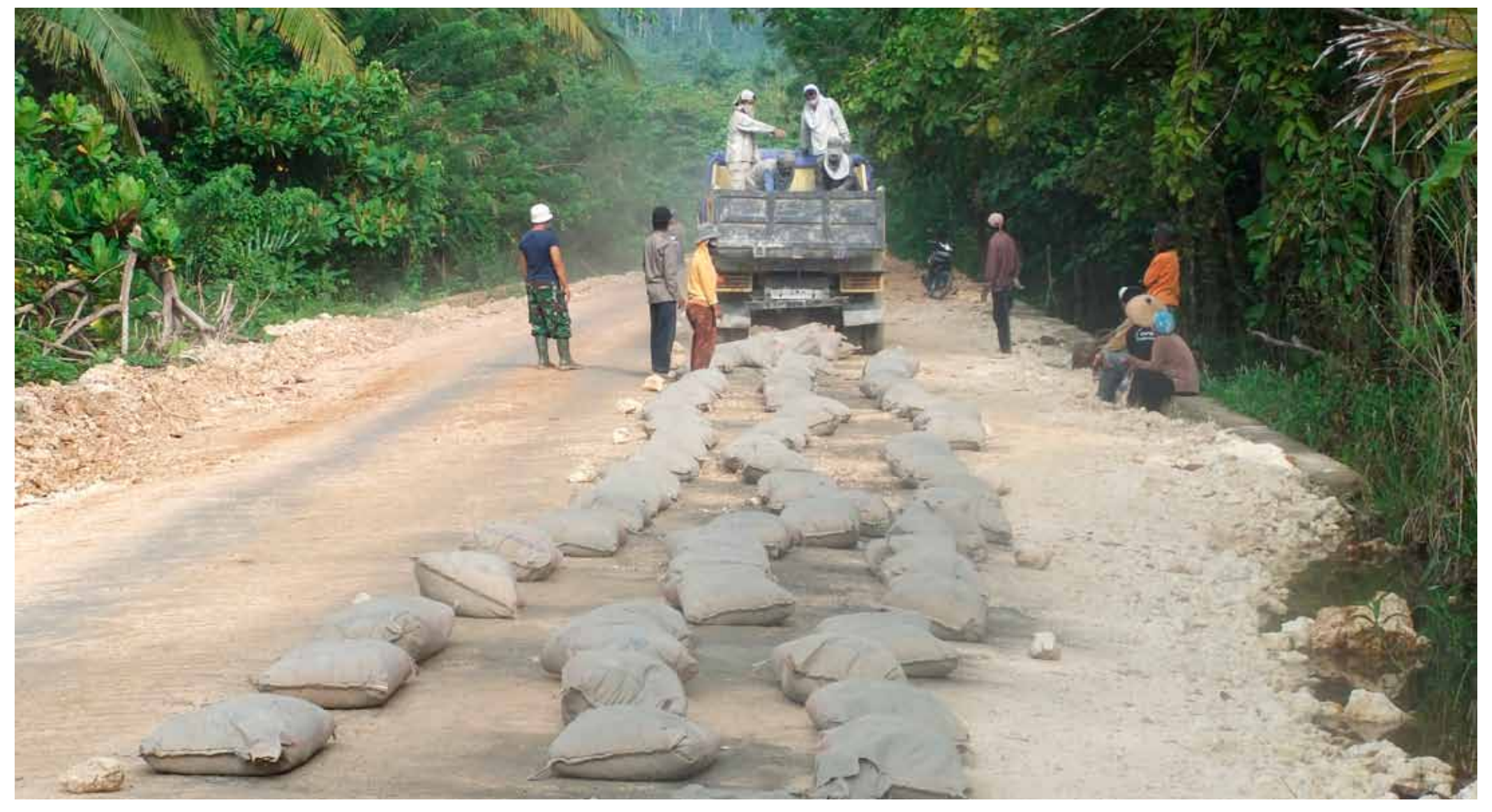
Distribution of cement bags