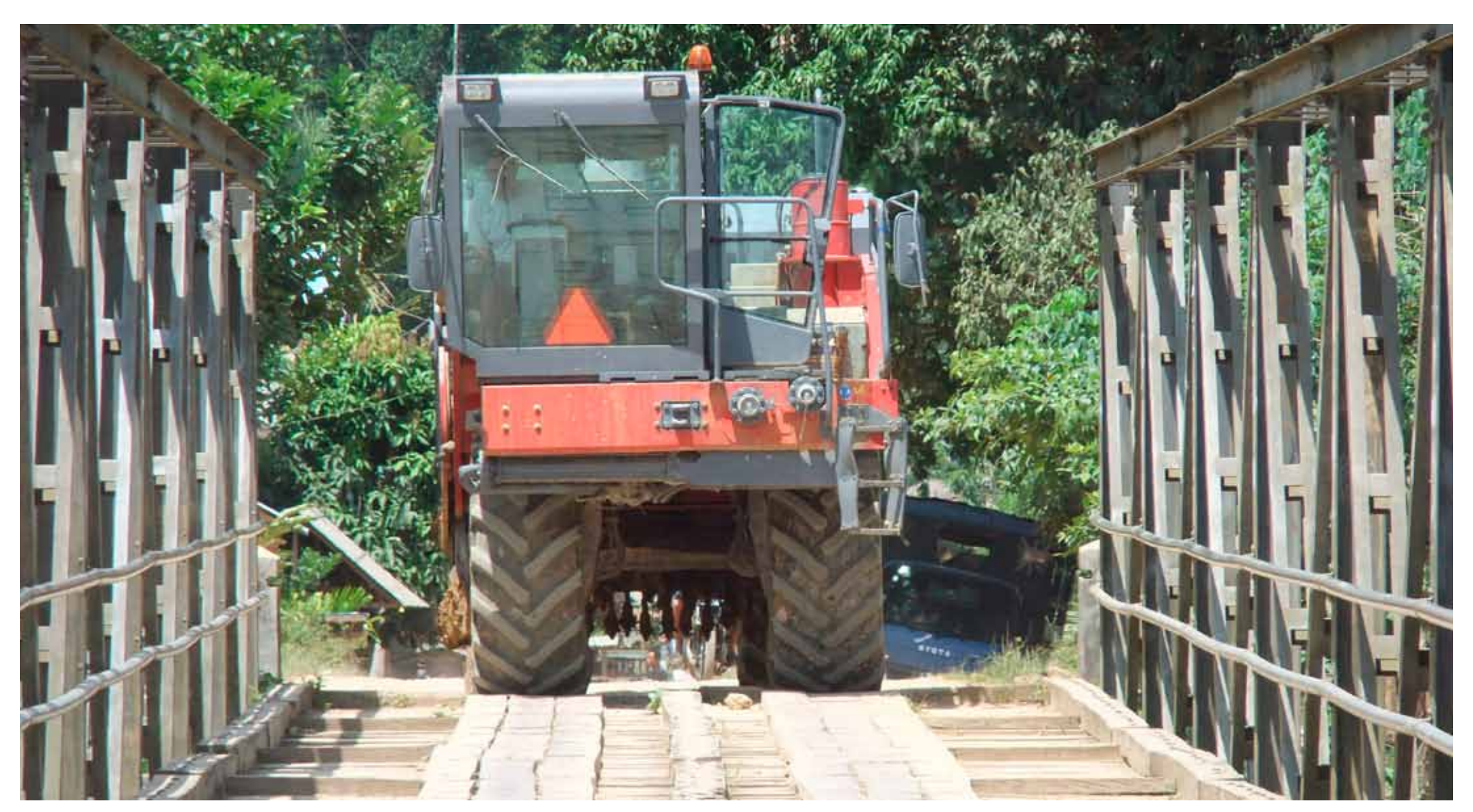
Transportation of the milling unit