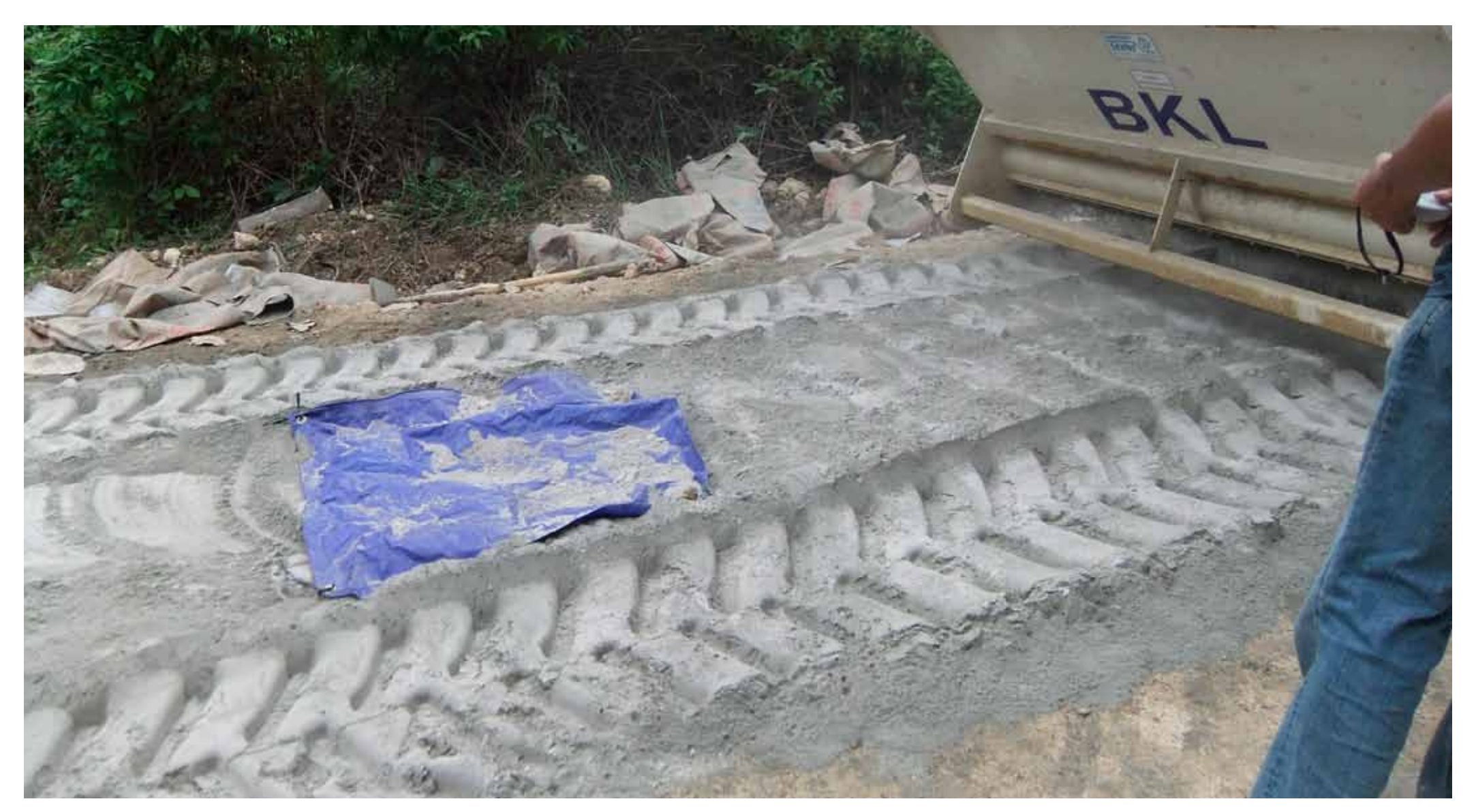
Check of spreaded amount of NovoCrete