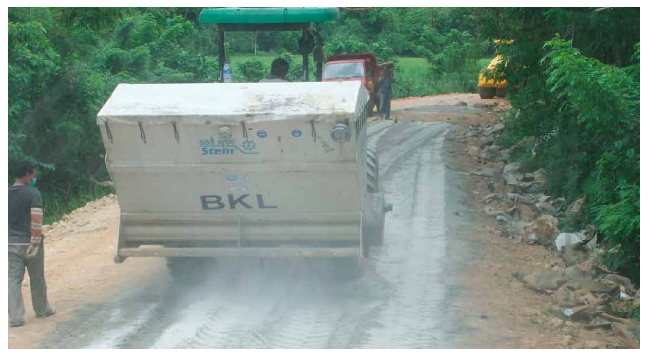
Spreading of NovoCrete