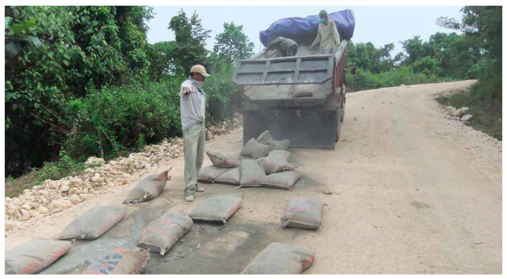
Distribution of cement bags