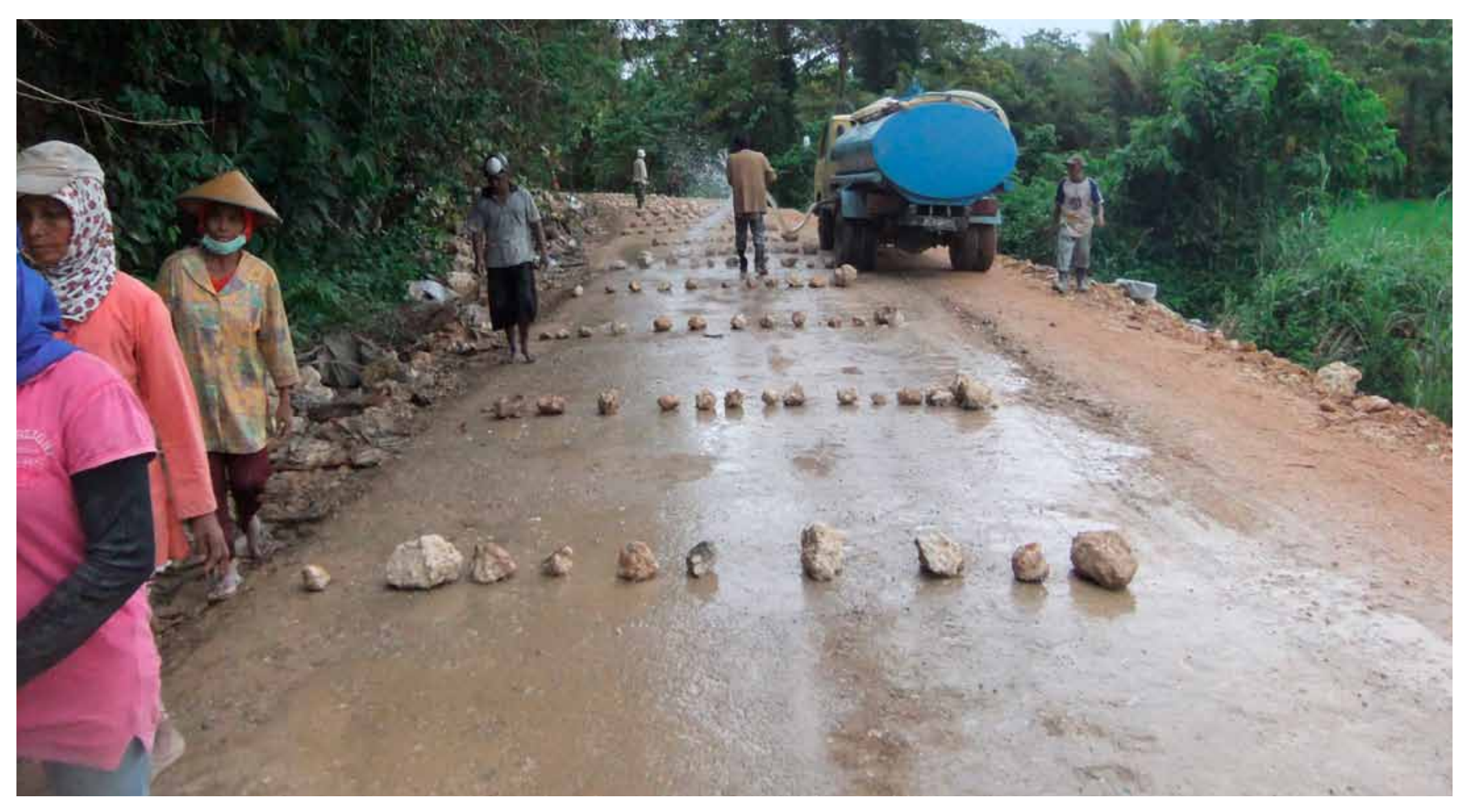
Finished area blocked for traffic