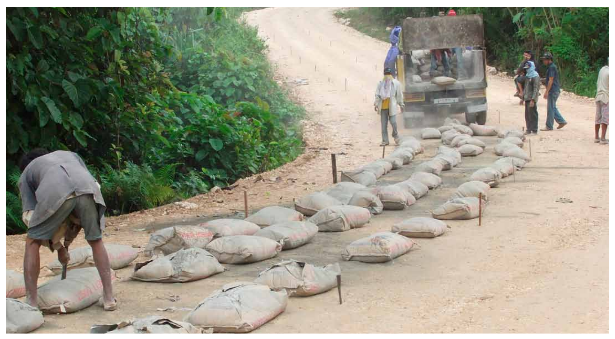
Distribution of cement bags