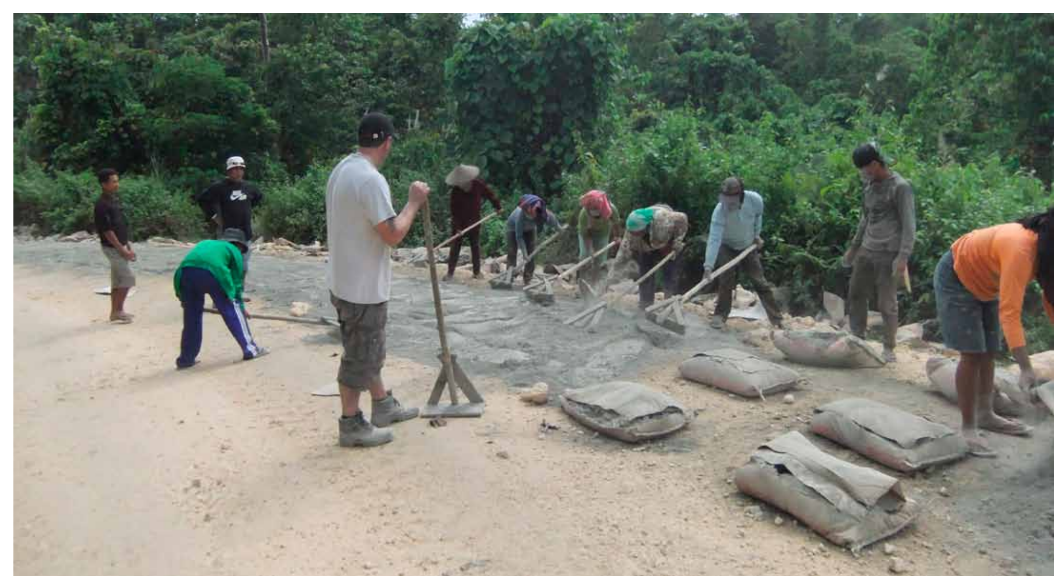
Manually distribution of cement