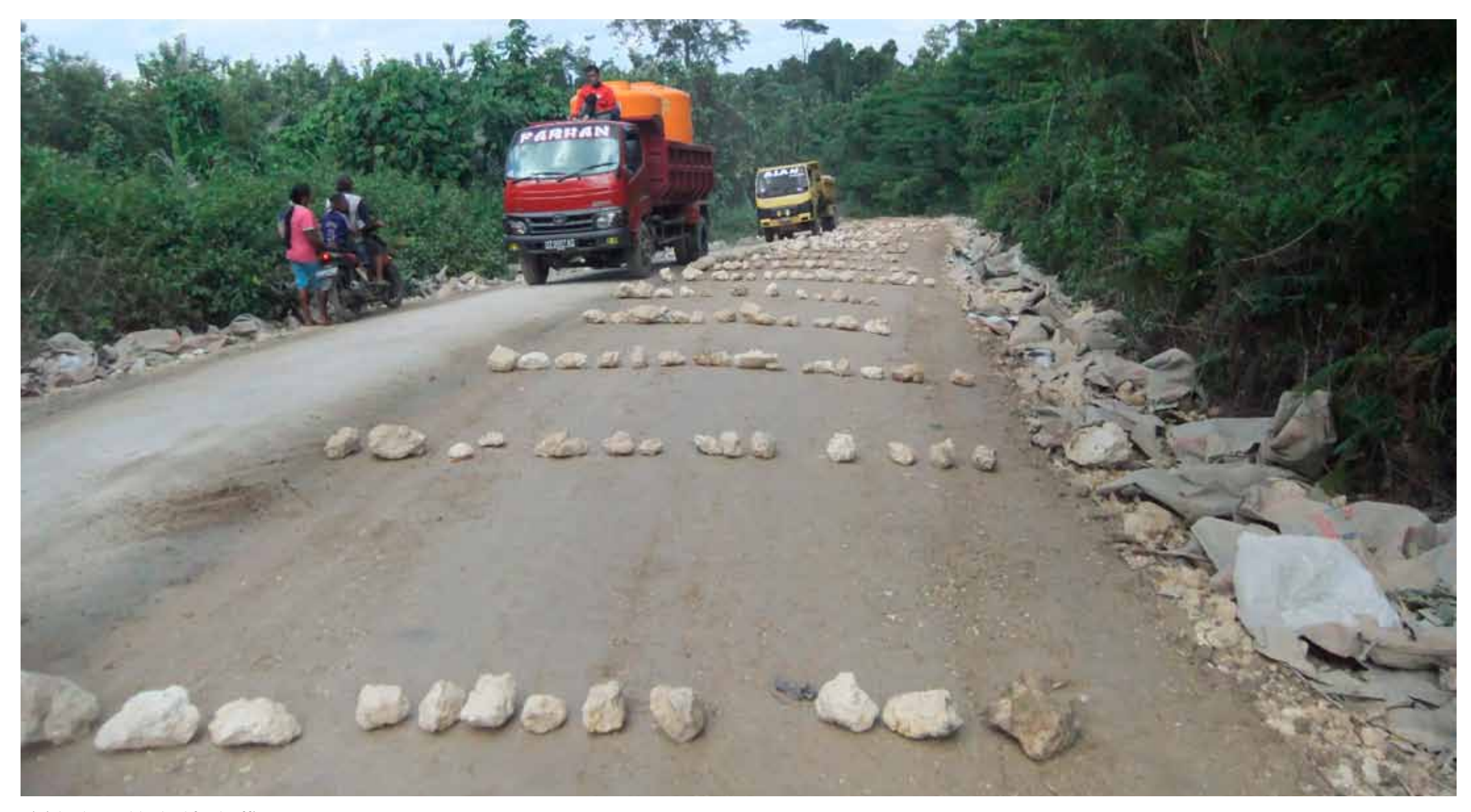
Finished area blocked for traffic