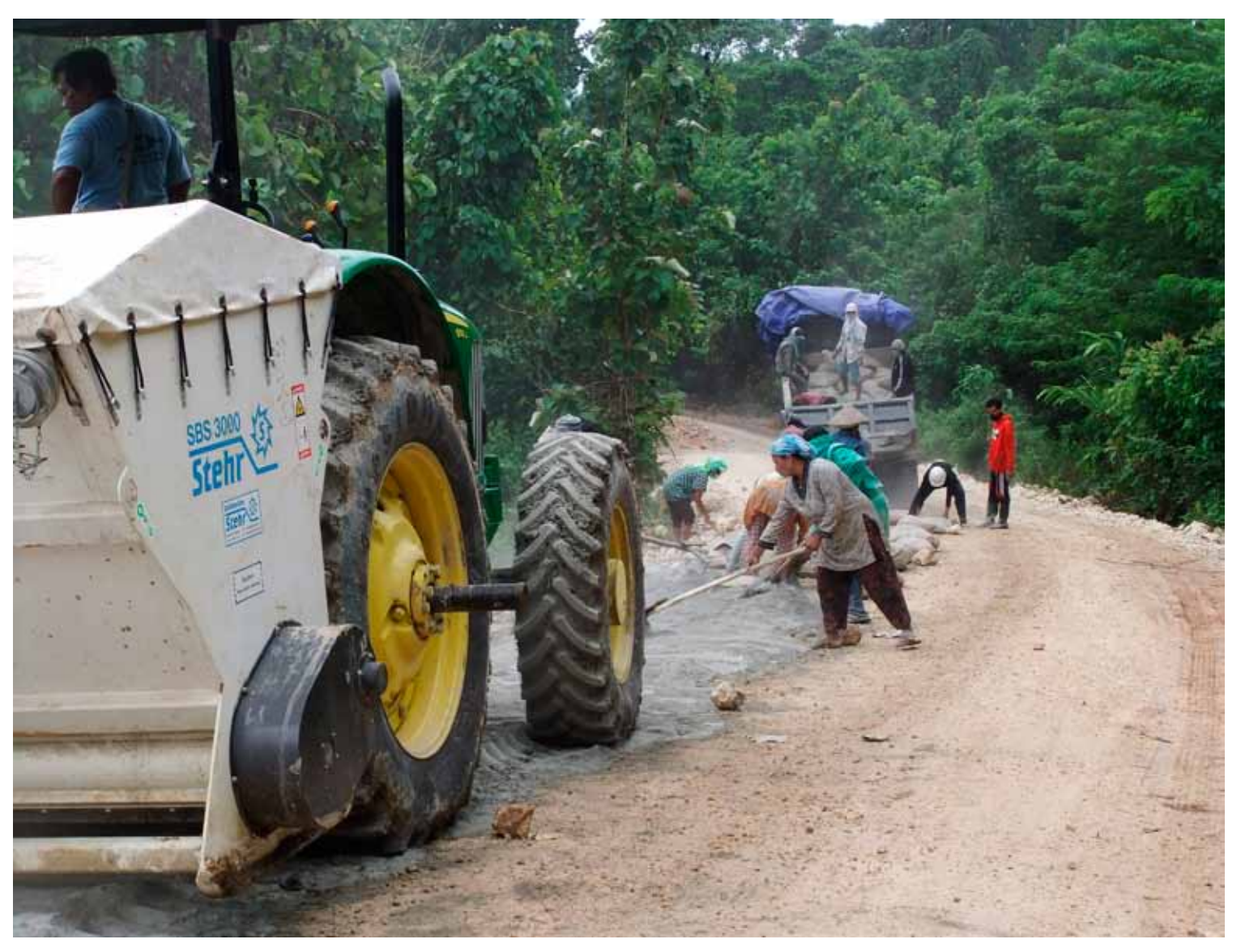
Spreading of NovoCrete