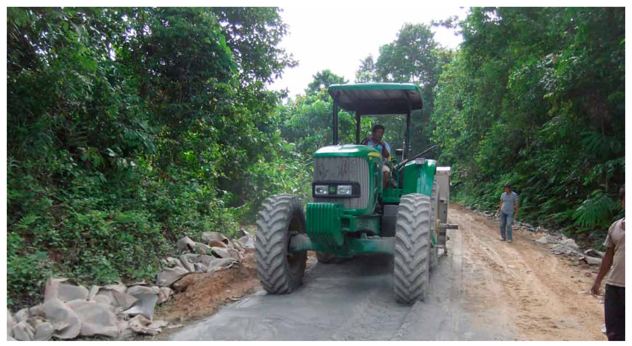
Spreading of NovoCrete