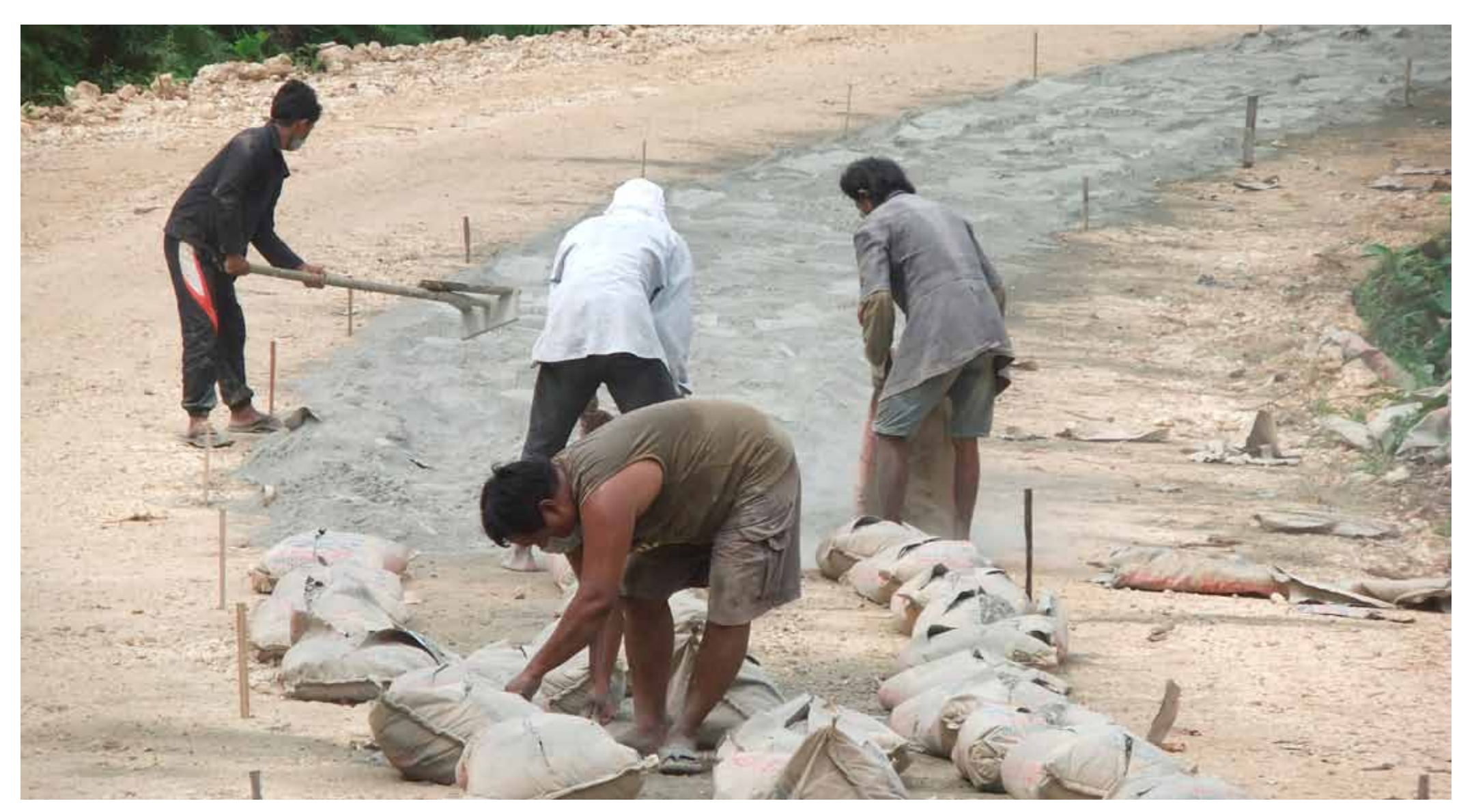
Manually distribution of cement