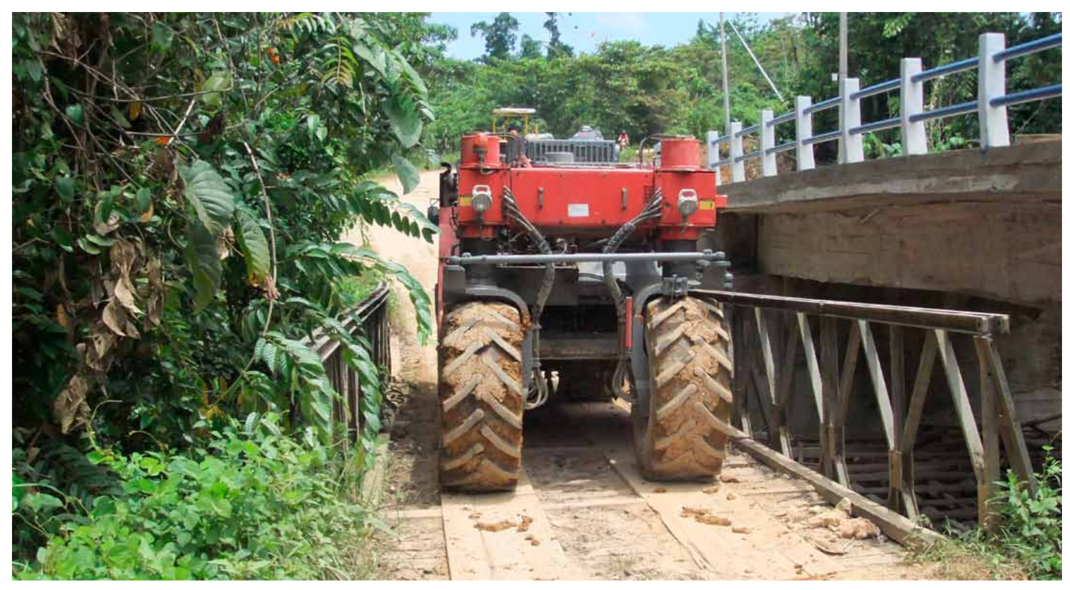
Transportation of the milling unit