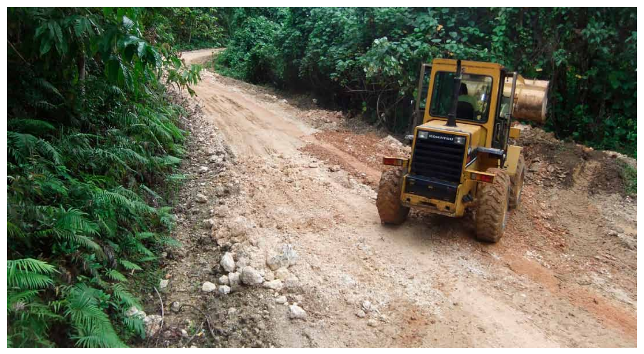
Preparation of the rough level