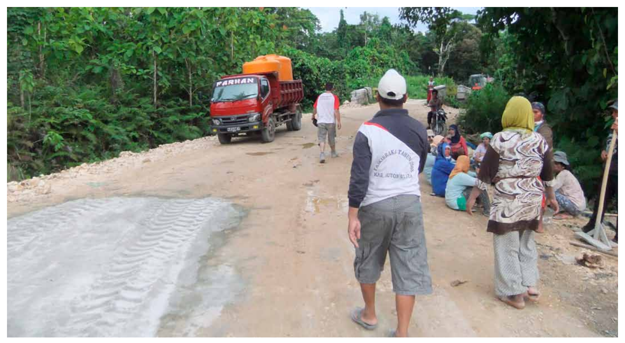
Spreading of cement