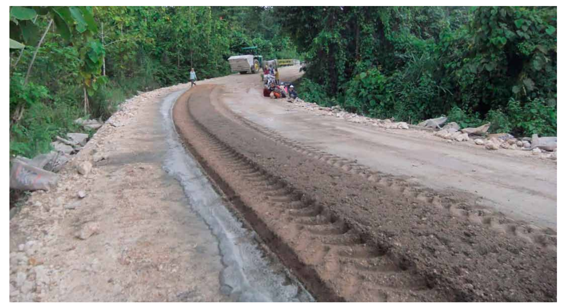
Situation after the milling procedure