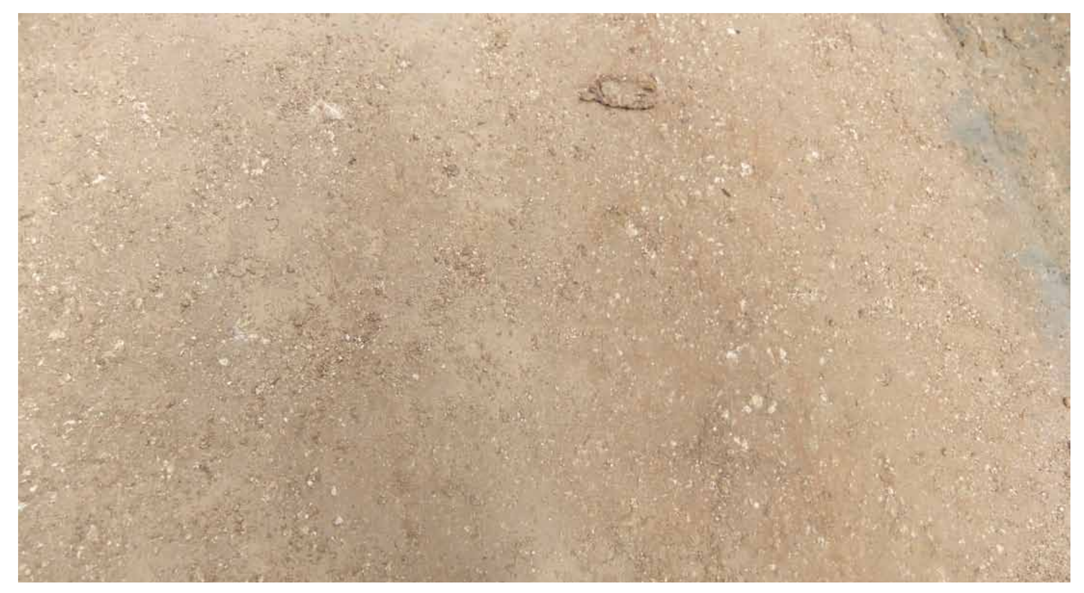
Close-up of the finished surface