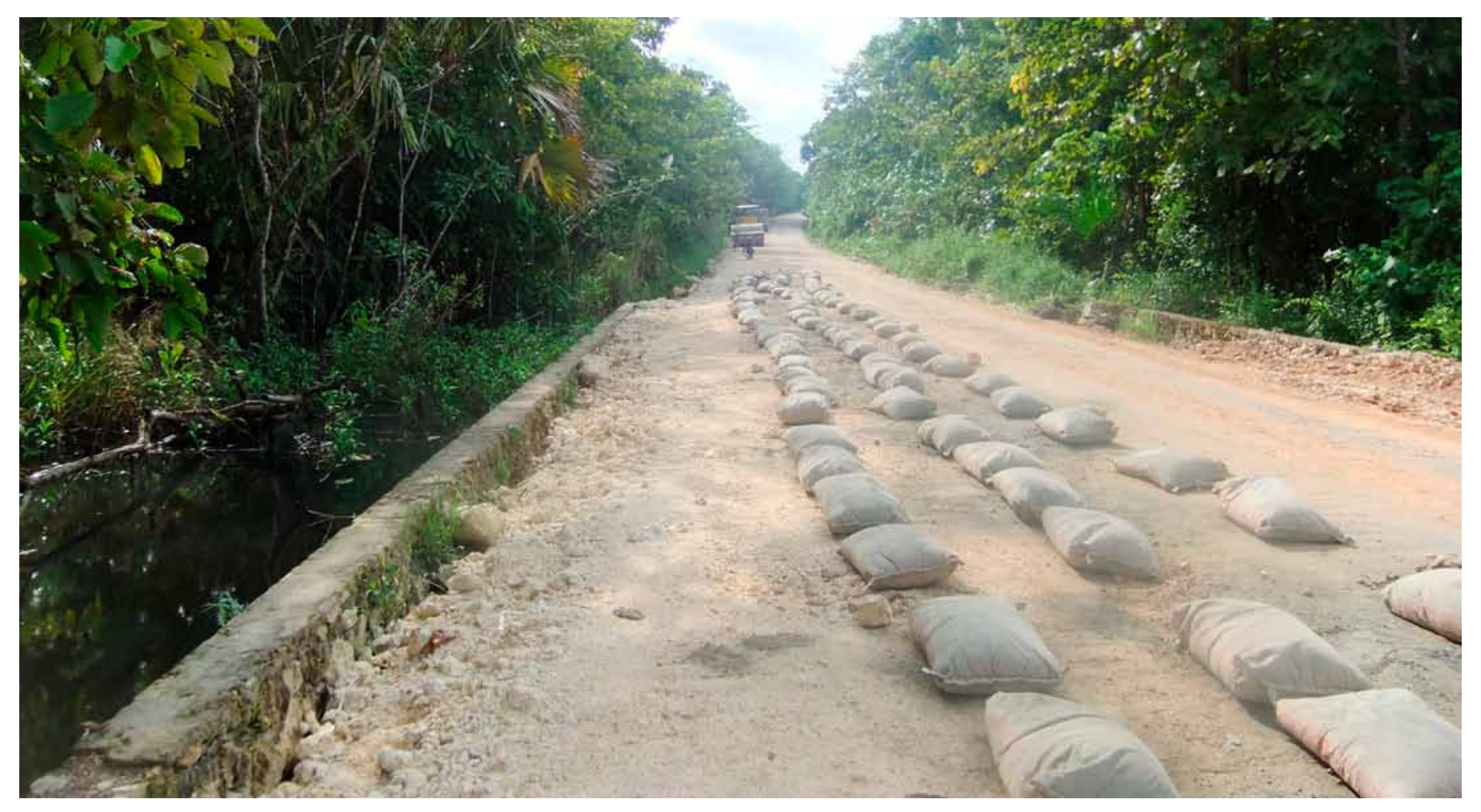
Distribution of cement bags