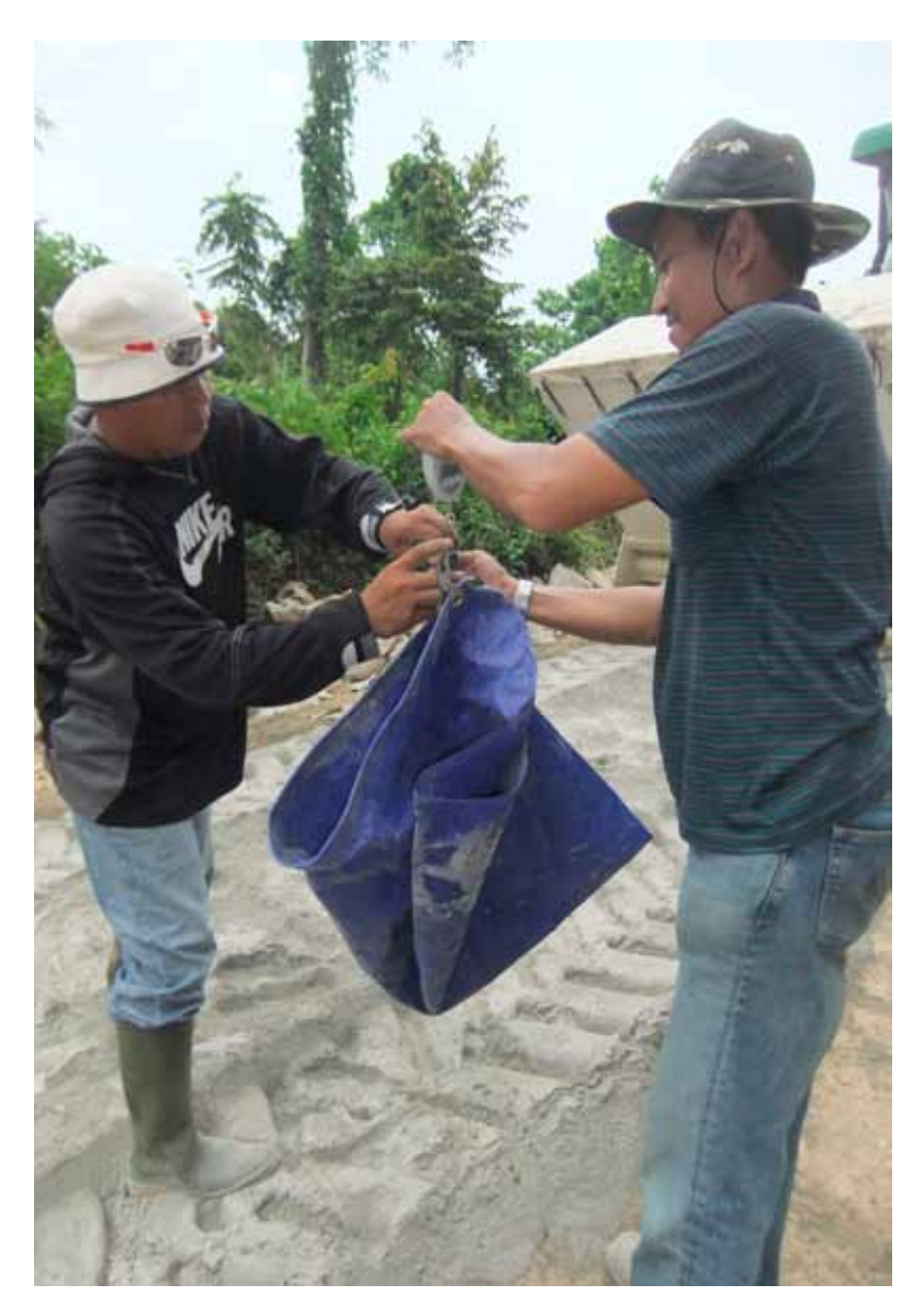
Check of spreaded amount of NovoCrete