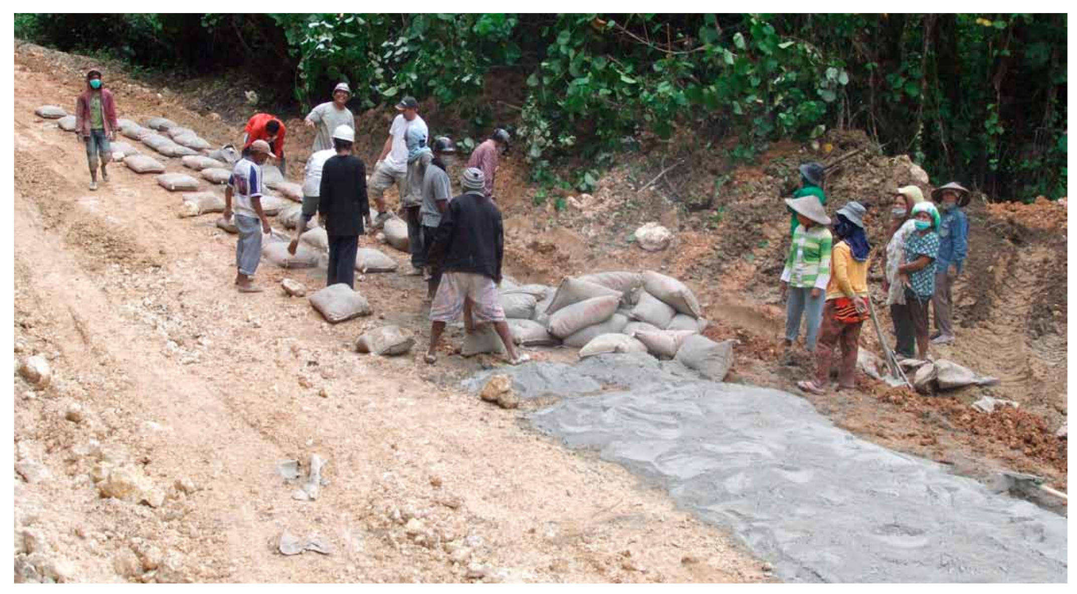
Distribution of cement bags