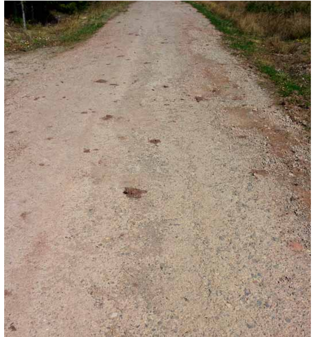
Status after more than 7 years (with heavy truck traffic and several strong frost periods)